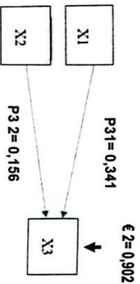
Figure 4.6 Relationship of Structure Path Diagram 2 3. Structure Path Coefficient 1,2 and 3

The results of the calculation of structure 2 can be seen in the path diagram below: