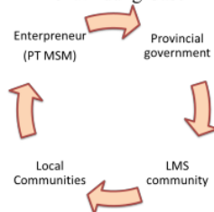
Figure 1. Relationship between Conflict Actors in Tokatindung Case

Based on the framework of inter-student relationships conceptualized through conflict mapping described above, the study will also depart from the concept of relevant theoretical understanding as commonly used to explain social phenomena that occur in society based on the concept of conflict theory. Collins [12] argued that coercion included violence as an important way to control conflict. Nevertheless, he also acknowledged the importance of unifying symbols to overcome conflicts, both on an individual, social, and structural level. Gramsci [13] Meanwhile, put pressure on the ruling class's hegemony as a form of dominance underpinned by conflict. Dahrendorf [14] further emphasizes that what underlies social conflict lies in power relations and even ownership relationships.